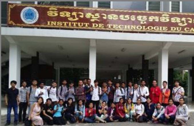
Students with their mentors during a progress report writing session

However, of equal importance, is the need for a guide, an advisor, a mentor who can take them through the maze of personality development, social communication and media, work ethics and many other elements that are crucial to the workplace.