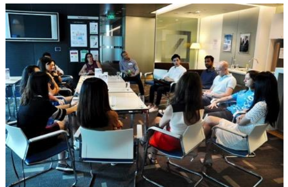
Fundamentals of the Trading Floor Deutsche Bank Operational activities, trends, requirements, indicators