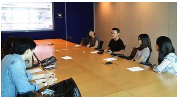
Personality Profiling Stage 2